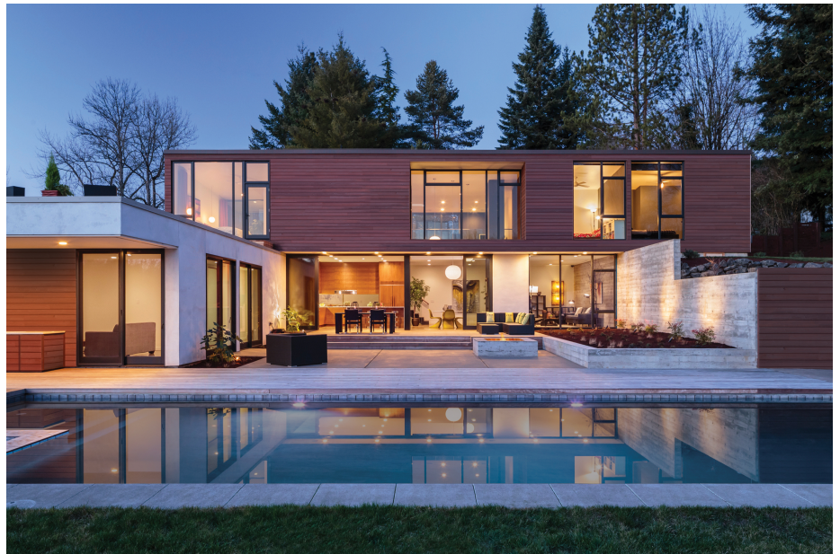
Thermo-Treated Ash Siding