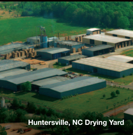
Huntersville, NC Drying Yard