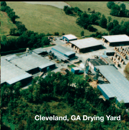
Cleveland, GA Drying Yard

Purveyors of fine hardwoods for more than 60 years