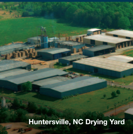
Huntersville, NC Drying Yard