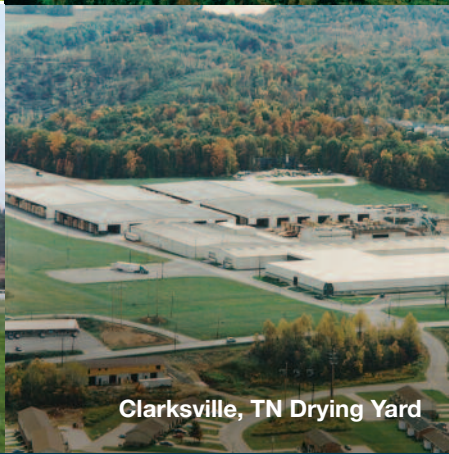
Clarksville, TN Drying Yard