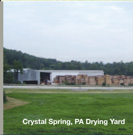
Crystal Spring, PA Drying Yard

Purveyors of fine hardwoods for more than 60 years