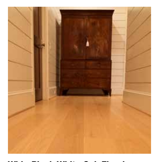
Wide-Plank White Oak Flooring