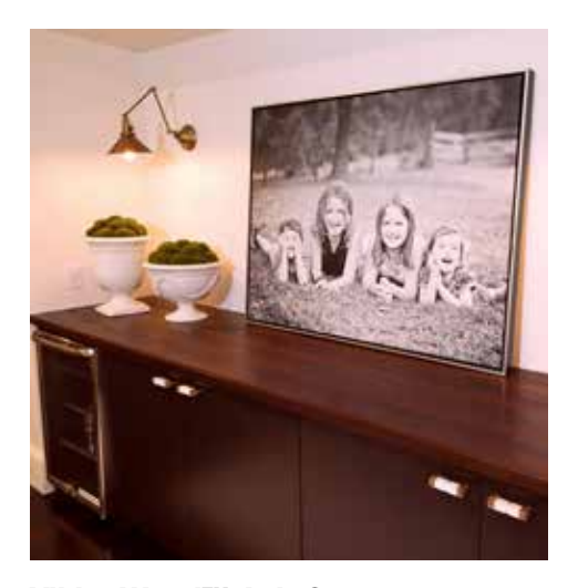
VikingWood™ Ash Countertop