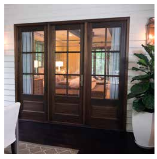
Red Grandis Exterior Doors