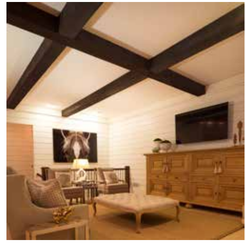
Rustic Interior Cypress Beams