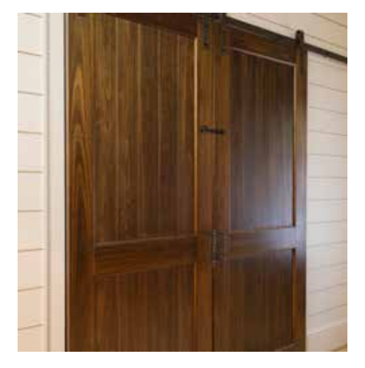
Red Grandis Interior Barn Doors