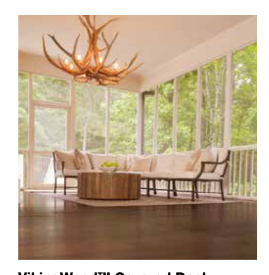
VikingWood™ Covered Deck