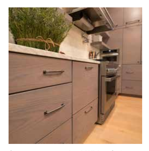
Sequence-matched White Oak