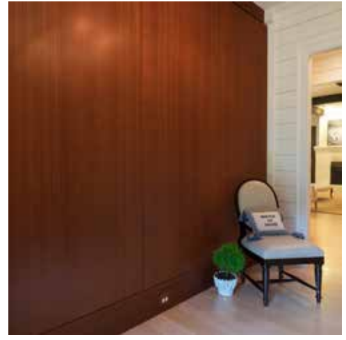
Sapele Veneer Entry