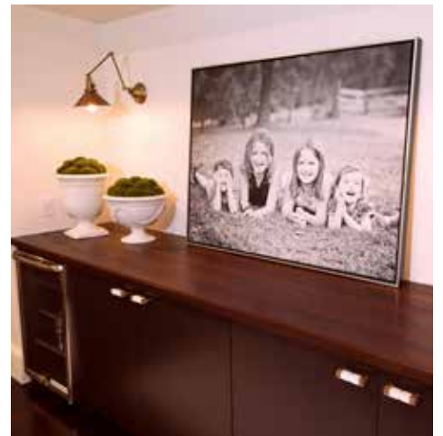
VikingWood™ Ash Countertop