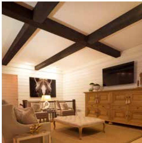
Rustic Interior Cypress Beams