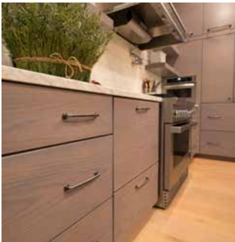
Sequence-matched White Oak