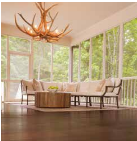
VikingWood™ Covered Deck