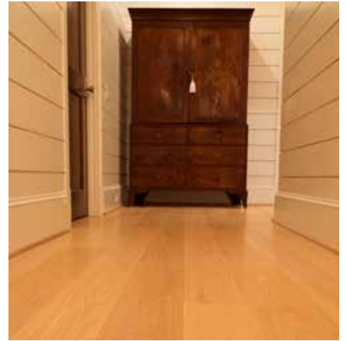
Wide-Plank White Oak Flooring