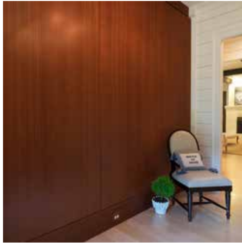
Sapele Veneer Entry