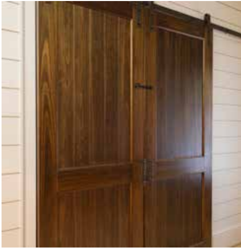
Red Grandis Interior Barn Doors