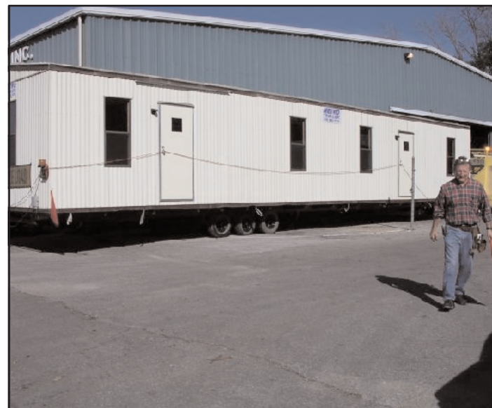
Hardwoods, Inc. gets a new " temporary " office.