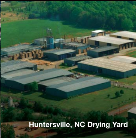
Huntersville, NC Drying Yard