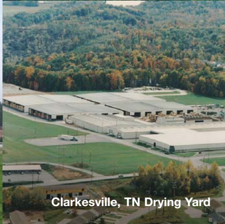
Clarkesville, TN Drying Yard