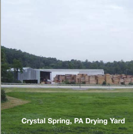
Crystal Spring, PA Drying Yard