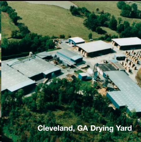
Cleveland, GA Drying Yard