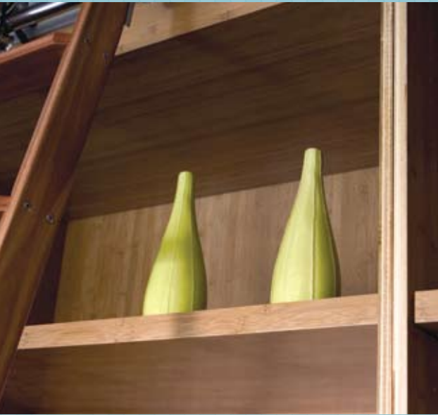
Library in the U.S. Green Building Council’s LEED® Platinum headquarters; fabricated using PureBond® veneer core hardwood plywood with bamboo veneers.

What really makes PureBond special is that it’s cost-competitive with the standard UF construction