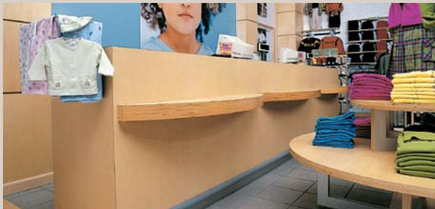
The Children's Place, Portland, Oregon.

Europly is more than attractive. It's strong and resilient, and its nearly void-free construction provides excellent machinability. With a tighter thickness tolerance than standard veneer-core panels, it also processes more efficiently, making it ideal for high-volume production.